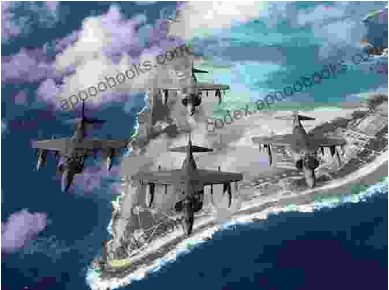
A Marine Corps fighter squadron flying over the Pacific Ocean.