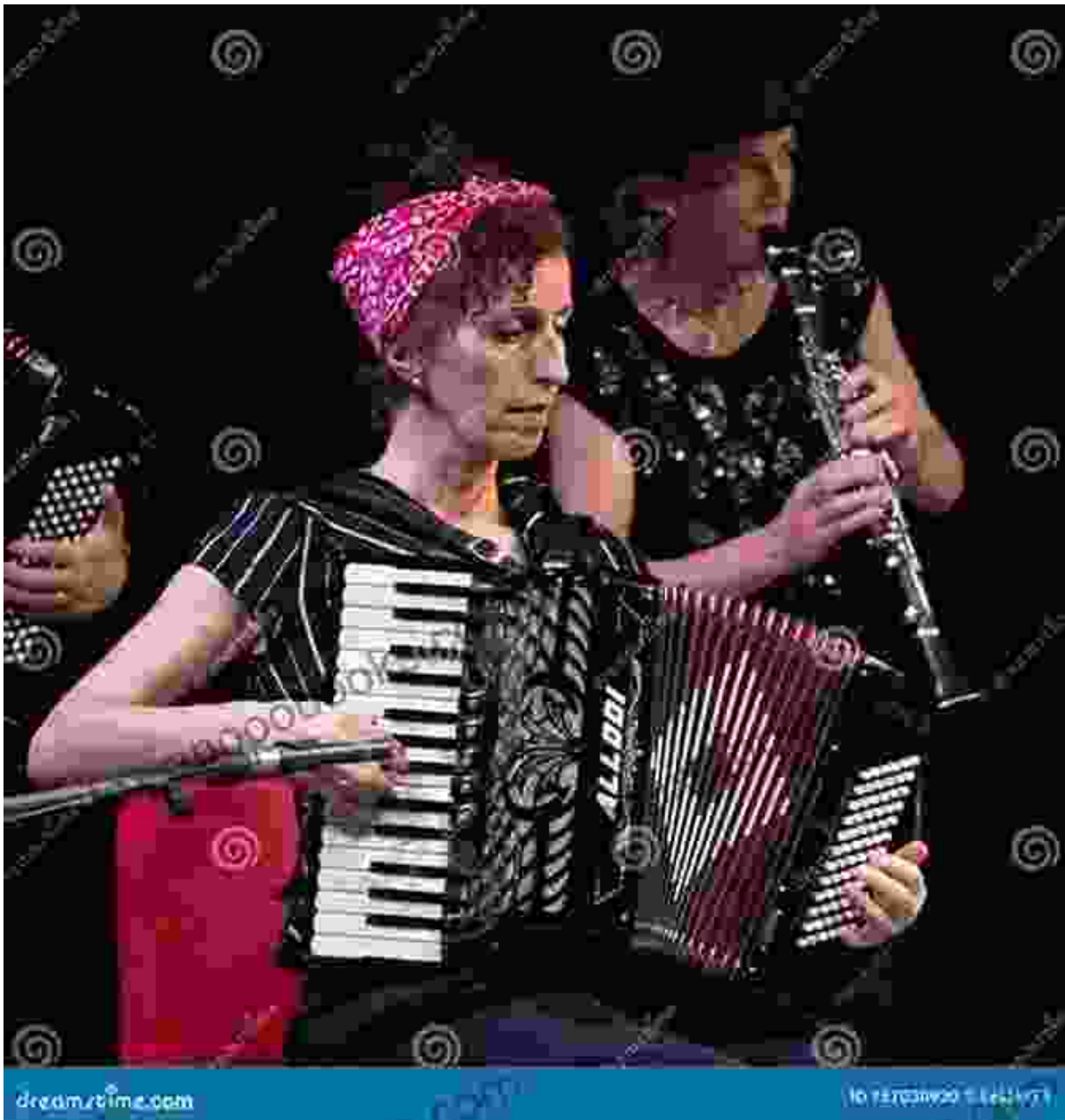
Klezmer musicians performing at a festival.

experiment with new sounds and styles. These musicians, such as Andy Statman, Giora Feidman, and the Klezmatics, helped to introduce Klezmer music to a wider audience and paved the way for its continued growth and popularity.