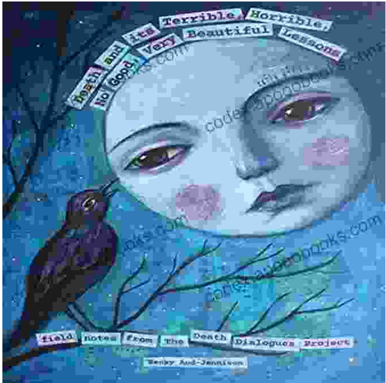
Death and its Terrible, Horrible, No Good, Very Beautiful Lessons: Field Notes from The Death Dialogues Project