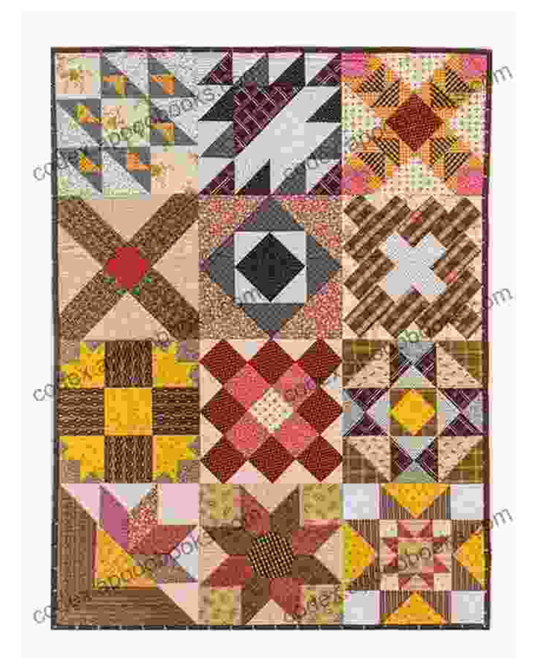
Free Download Your Copy Today

The quilt has toured the country, inspiring countless visitors with its message of love and understanding. It has been featured in museums, galleries, and even the White House, where it served as a reminder of the importance of healing and unity.